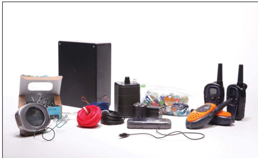
FIGURE 1.—Suspicious items.

The venue should prepare a list of illegal and prohibited items and distribute this list to employees, contractors, event staff, and ticket holders. Screening procedures should specifically state which items should be temporarily stored or surrendered to enable the patron to enter the venue. Patron screening is risk-based and intelligence-driven. It should occur at a level of detail commensurate with the threat associated with the event being hosted, a patron’s prior history, etc.