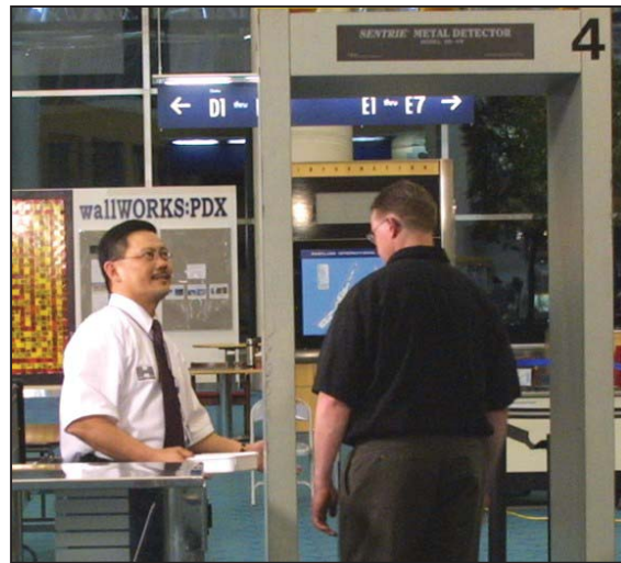
FIGURE 2.—Walk through metal detectors.

Walk through metal detectors (WTMDs) are an option for patron screening. They allow facilities to screen patrons quickly and effectively, while maintaining a level of efficiency that ensures a high throughput rate. WTMDs fall into two categories: single zone detection and multi-zone detection.