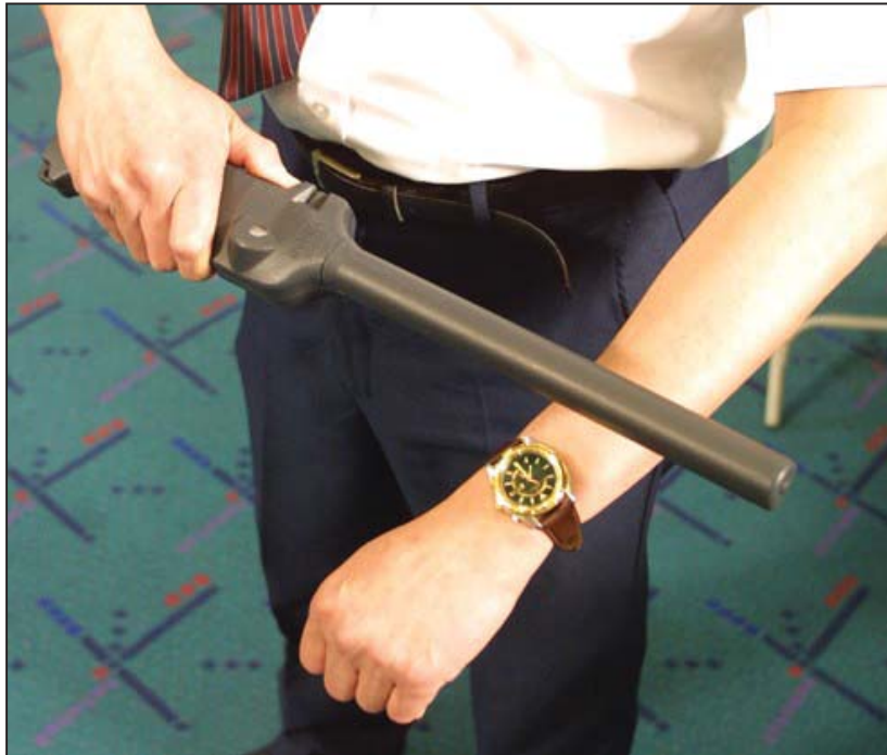
FIGURE 3.—Hand held metal detector.

A hand held metal detector (HHMD) is another general screening device that can be used as either the primary or secondary screening tool. If used as the primary tool, one of the most effective methods is to conduct a pat-down as the secondary search. Generally, HHMDs become an alternate screening device if a patron has set off a WTMD alarm and the operator has not been able to resolve the source of the alarm.